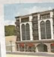
The Heritage Riverview planned for the 100 block Street in Easton.

Perhaps the best sign Delaware Terrace to New version on the city's location, but a major update SEE EASTON, A2