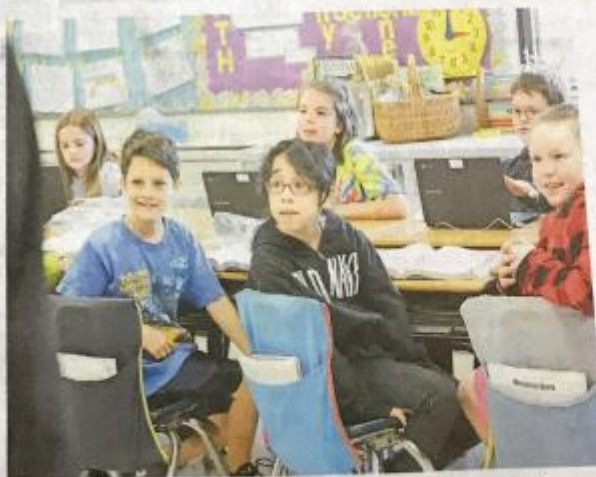
Students are awestruck during Sun's visit to present Most Valuable Player lanyards to two third-grade classes.

"Math is what is known as a universal language,"